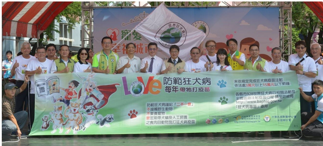
Officers of Central government and Tainan Veterinary Service gathered together on the World Rabies Day on 2017/10/01.