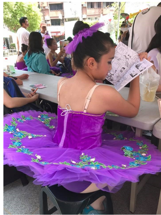
Children were joyful working rabies coloring (left) and watching comic (right).