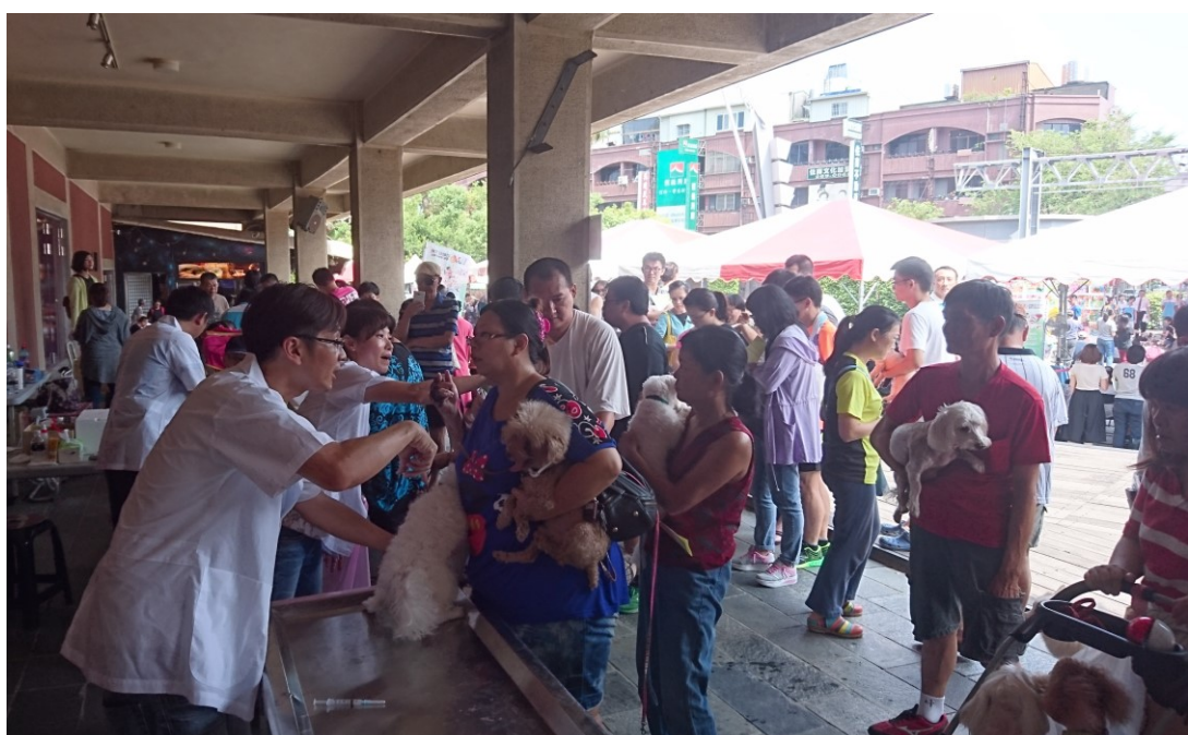
Pet owners enjoyed the World Rabies Day campaign and waiting for dog vaccination at Tainan City on 2017/10/01.